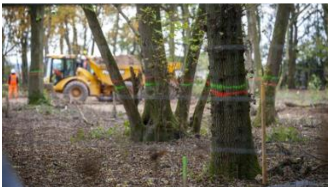
HS2 ancient woodland habitat move 'a smokescreen'