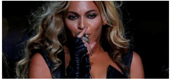
Weekly quiz: Which hits swell Church of England coffers?