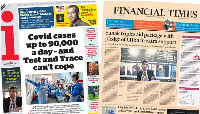
Test and trace 'can't cope' and jobs aid 'triples'