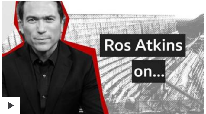
Why fishing is a stumbling block in Brexit talks