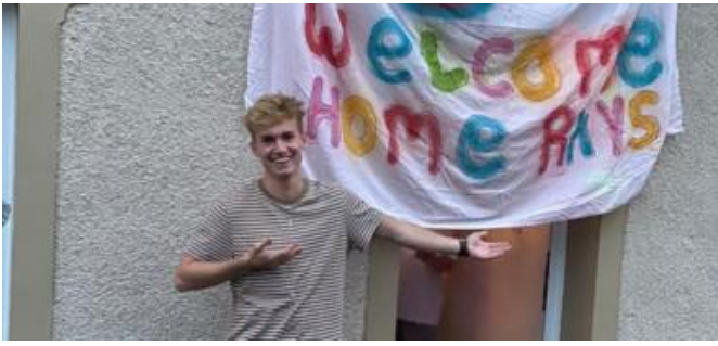
Happy to be home after 61-day Italy quarantine