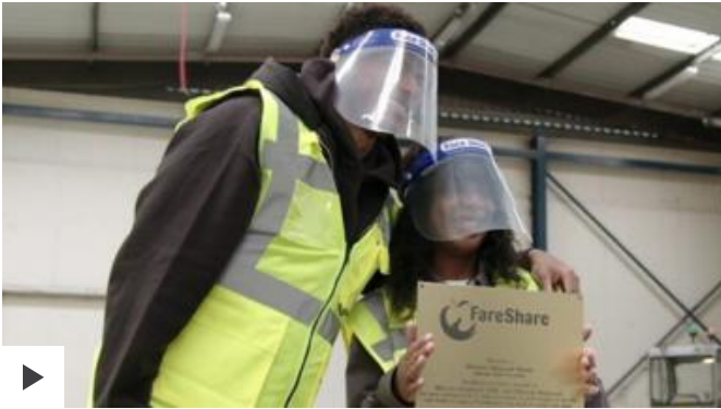
Marcus Rashford and his mum help out at foodbank