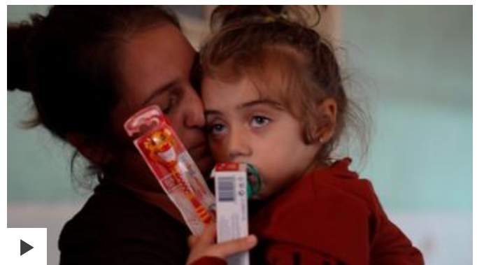
The three-year-old orphaned by war