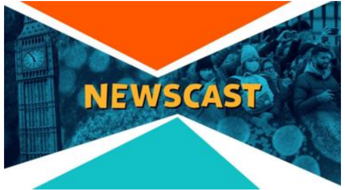
Newscast: George Osborne