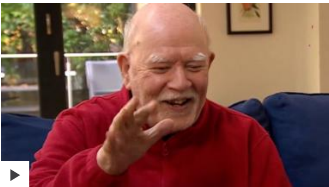
Composer with dementia meets students he inspired