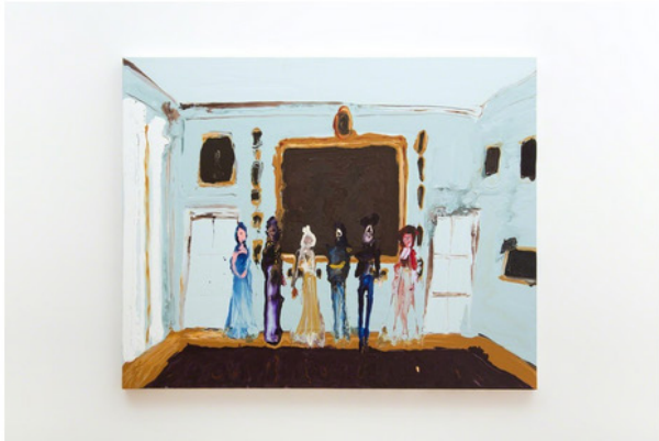
Genieve Figgis Royal Group, 2015 Almine Rech