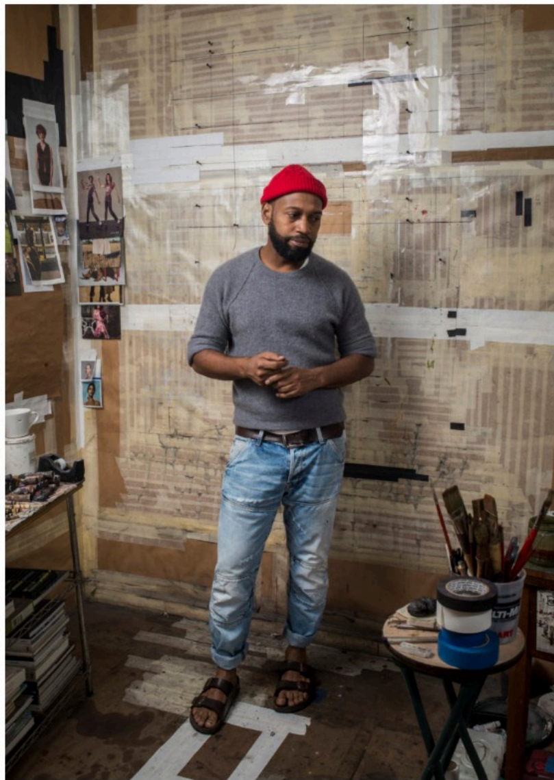
Nathaniel Mary Quinn in his studio.