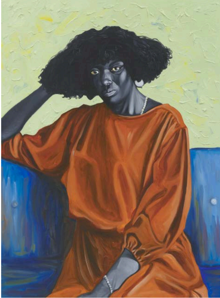
"Lady on Blue Couch" (2019), oil on canvas, 48 x 36 inches.