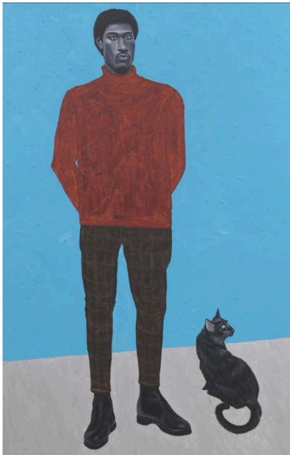
"Man and his Black Cat" (2019), oil on canvas, 86 x 54.75 inches.