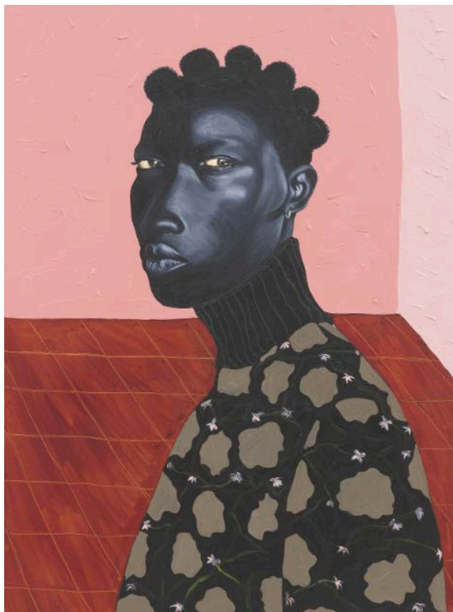
"Radiant" (2019), oil on canvas, 40.75 x 30.5 inches.