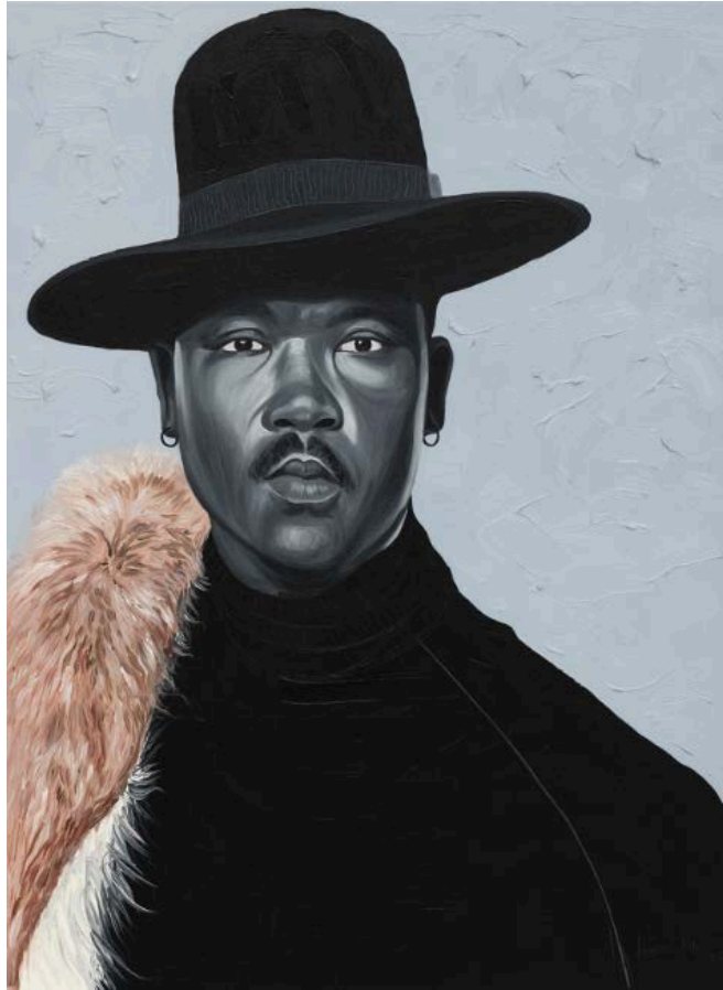
"Fur on Black" (2020), oil on canvas, 40.25 x 30 inches.