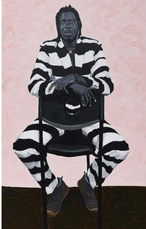
"The Artist II Kwesi Botchway" (2019), oil on canvas, 85 x 55 inches.