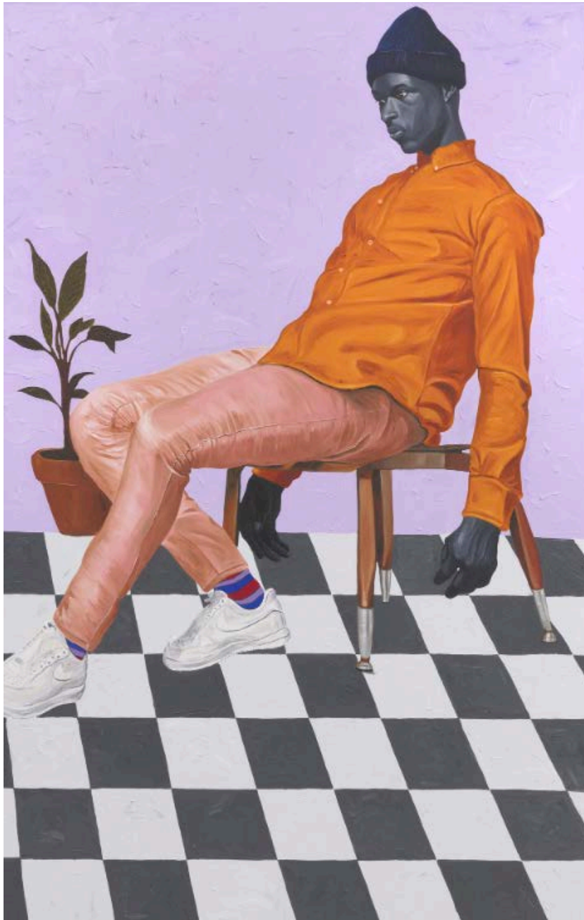
"Sitter" (2019), oil on canvas, 86 x 54.75 inches. Photo by Robert Wedemeyer. All images © Otis Kwame Kye Quaicoe and Roberts Projects, Los Angeles, shared with permission