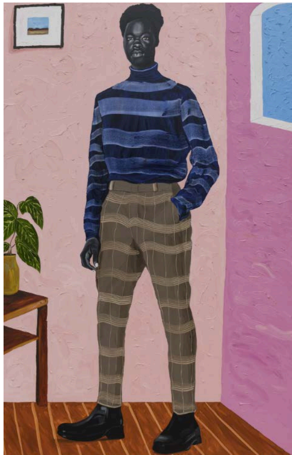
"Kwame Asare in Stripes" (2020), oil on canvas, 84 x 52 inches.