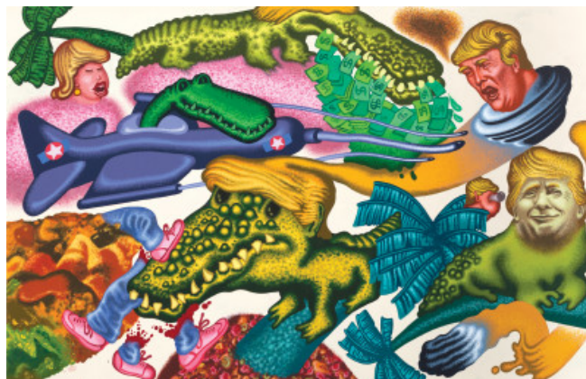
Peter Saul, Donald Trump in Florida , 2017.

Saul: I attempt liberalism, but it doesn't work usually. Art can't do anything for politics, but politics can help art. It can make a great subject. I've used it enough times and I hope it's been interesting. But as far as being convinced by a painting? Anyone who is influenced by a painting is an idiot.