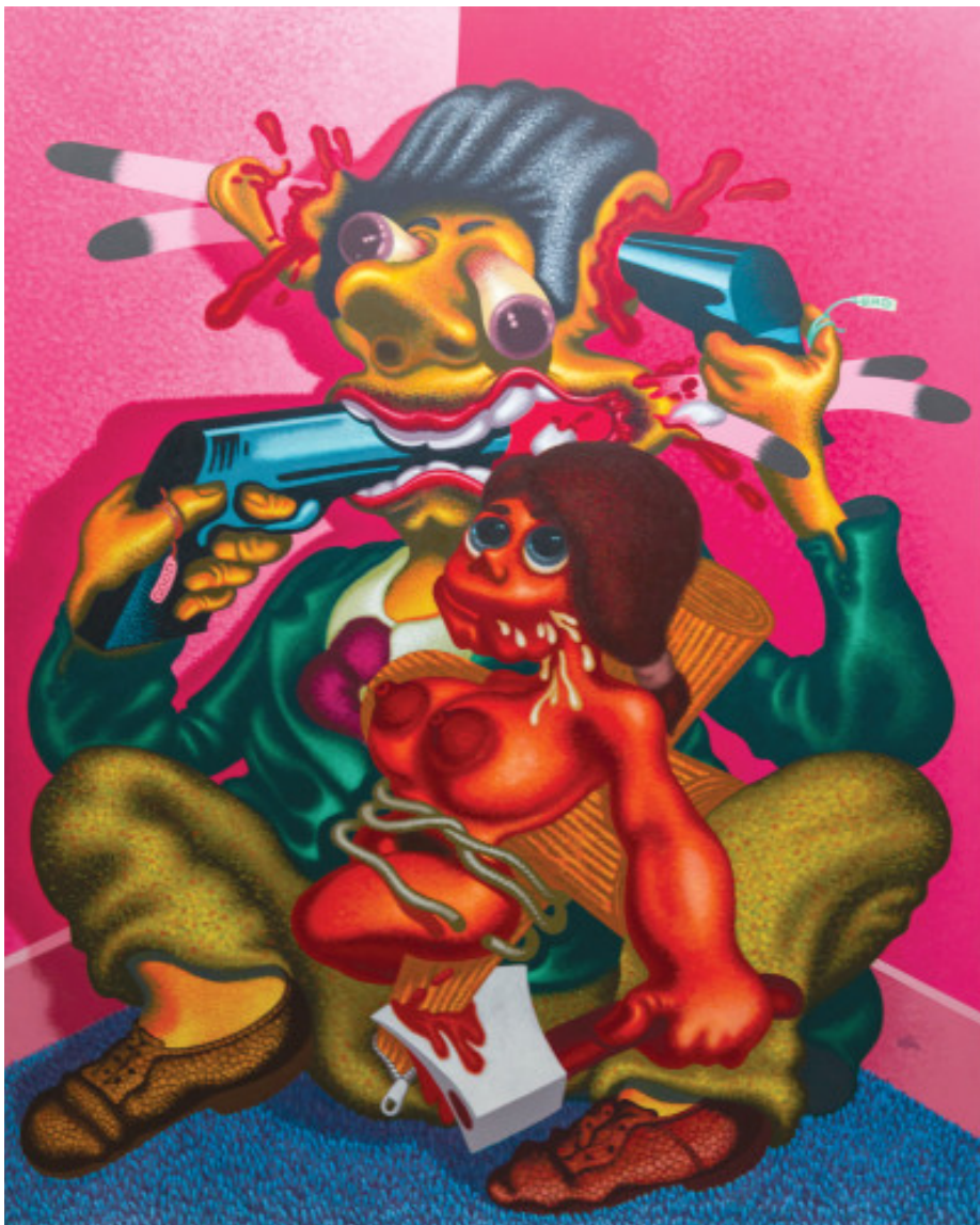
Peter Saul, Girl Trouble II , 1987.

Saul: I enjoyed it. I just asked each student what they were trying to do and helped them do it. I treated all paintings the same: spooky realistic pictures and big zigzag-y things—they're all the same to me. It also helps with the conversational ability you need as a modern artist. You need to sound convincing, because if you look at modern art from a certain distance, one thing is pretty much as good as another.