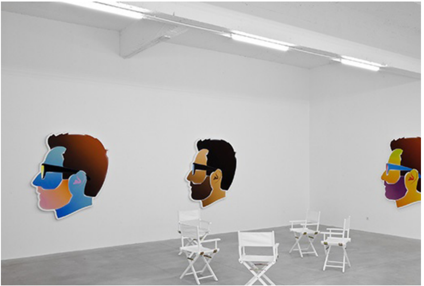
Alex Israel, installation views at Le Consortium, Dijon, 2013